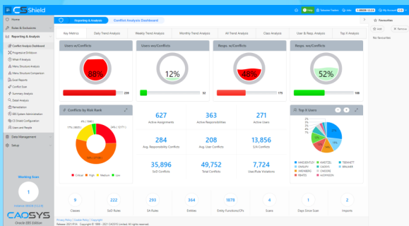
Fig. 1: Dashboard - Key Metrics

With no software to install and maintain, you can take full advantage of the latest in Cloud based technologies to get the answers you need quickly.