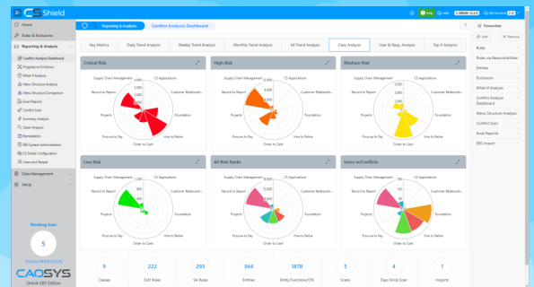
Fig. 2: Dashboard - Class Analysis